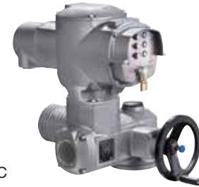
Actuator control unit AUMA MATIC and AUMATIC on request

The actuator should not be used with Hawle-E3 Elypso Valve for partial flow control.